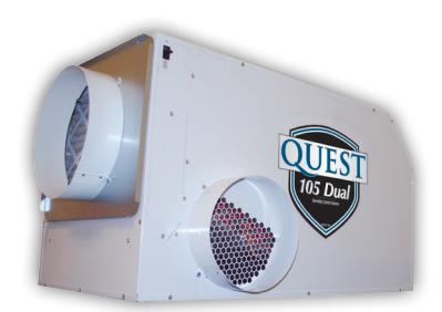
Duct Collar Kits are available for all 3 Duals.