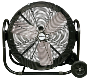
ADJUSTABLE METAL DRUM FAN 30" Item No. HGC736486