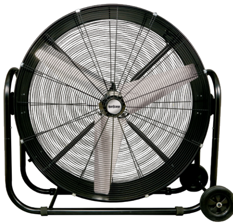
ADJUSTABLE METAL DRUM FAN 42" Item No. HGC736488