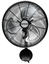
OSCILLATING METAL WALL MOUNT FAN 16" Item No. HGC736484