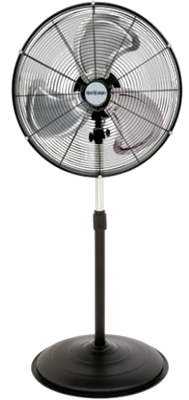
OSCILLATING METAL STAND FAN 20" Item No. HGC736472