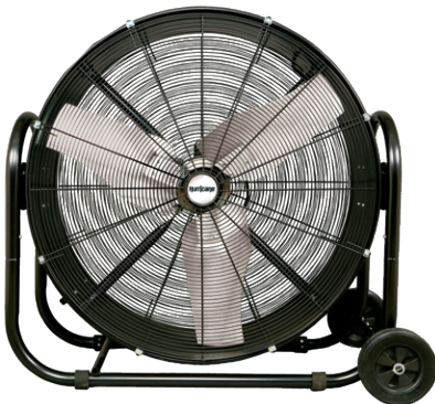
ADJUSTABLE METAL DRUM FAN 36" Item No. HGC736487