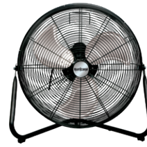
ORBITAL WALL / FLOOR FAN 20" Item No. HGC736492