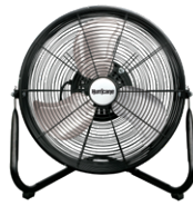
ORBITAL WALL / FLOOR FAN 16" Item No. HGC736491