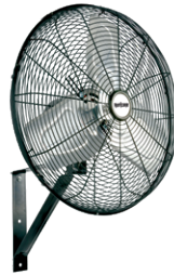
OSCILLATING METAL WALL MOUNT FAN 20" Item No. HGC736489