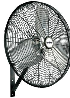
OSCILLATING METAL STAND FAN 30" Item No. HGC736490