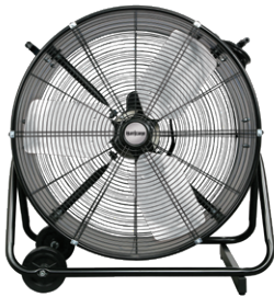
ADJUSTABLE METAL DRUM FAN 24" Item No. HGC736485