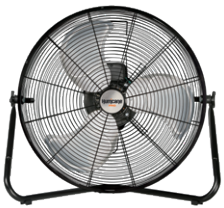
ADJUSTABLE METAL FLOOR FAN 20" Item No. HGC736476