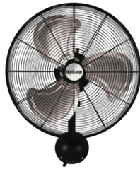
OSCILLATING METAL WALL MOUNT FAN 20" Item No. HGC736474