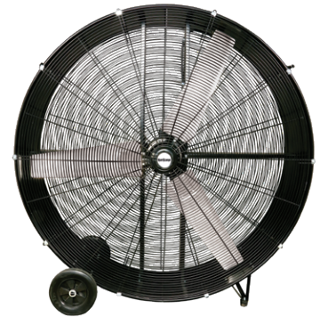
METAL DRUM FAN 36" Item No. HGC736479